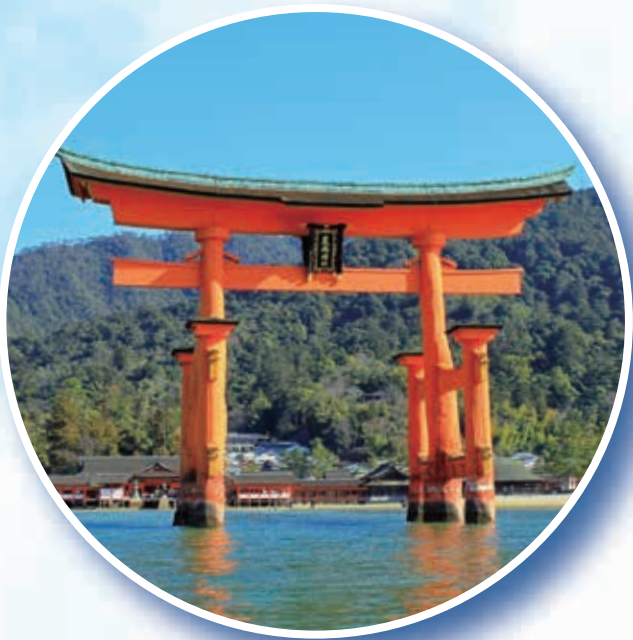
World Heritage Site Itsukushima Shrine

"Let's Learn More About Enjoyable Oral Surgery Techniques!"