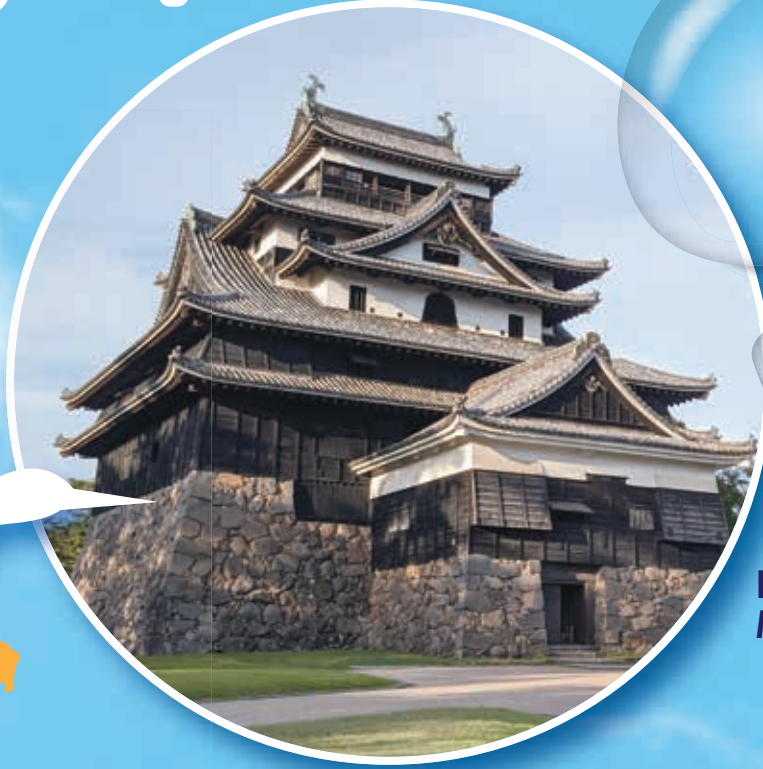
National Treasure Matsue Castle