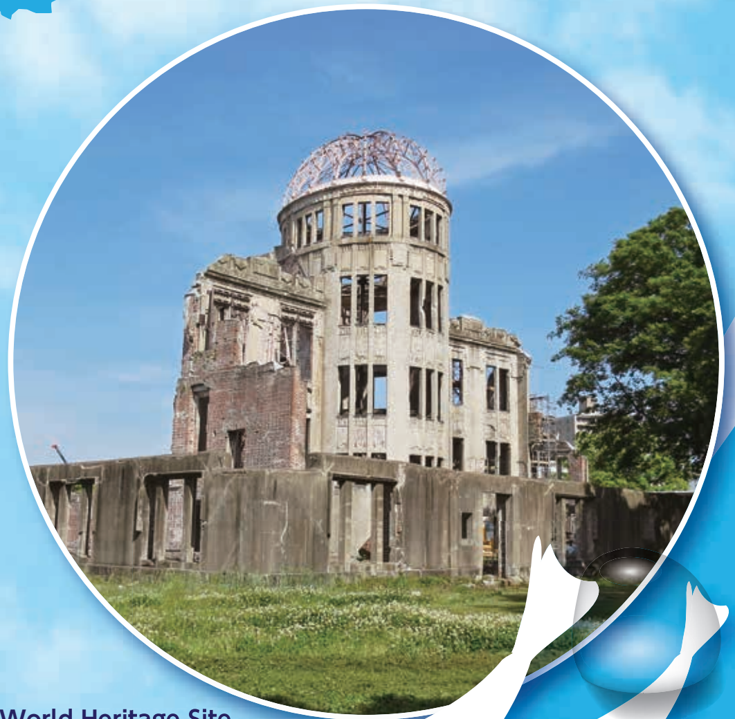
World Heritage Site Genbaku Dome